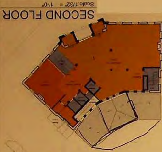
Exhibit 5a: Scheme "G" (May 2009)