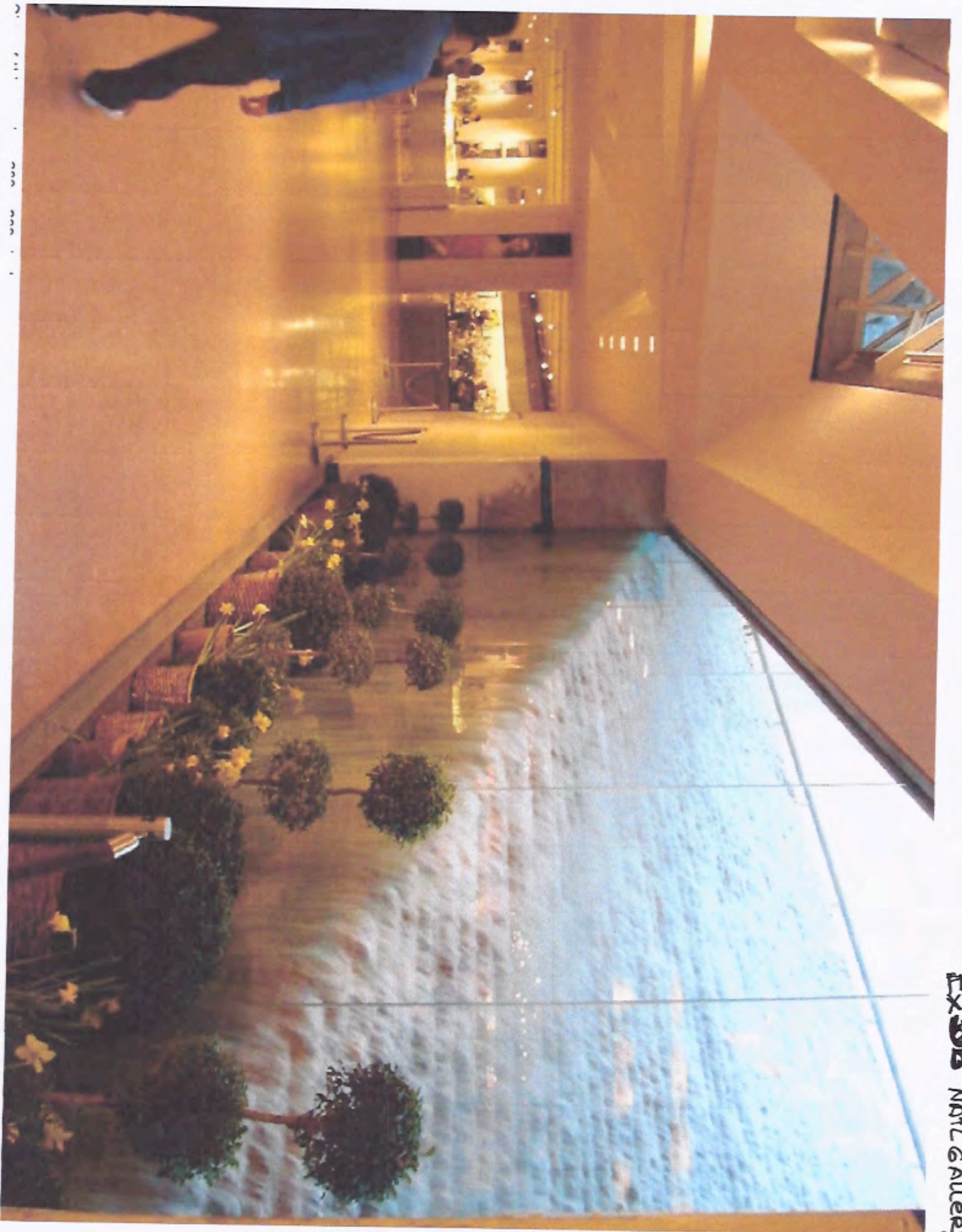
EX 5th North Gallery