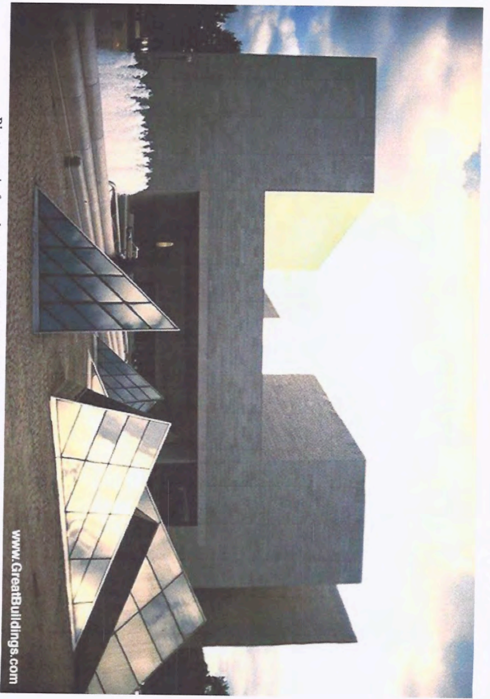
Photo, main facade overview · East Wing, National Gallery · Washington, D.C.